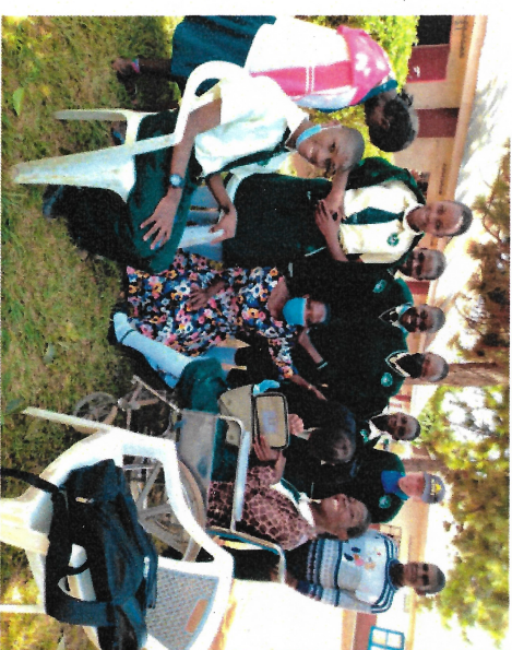
Volunteers of CVOVS: